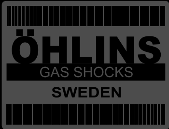
ÖHLINS RETRO BLACK