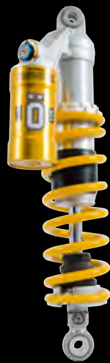
STX 46 SHOCK ABSORBER