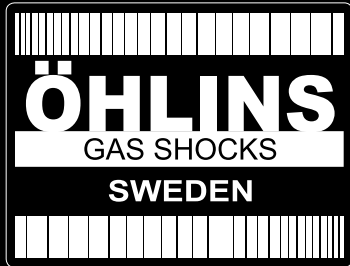
ÖHLINS RETRO WHITE