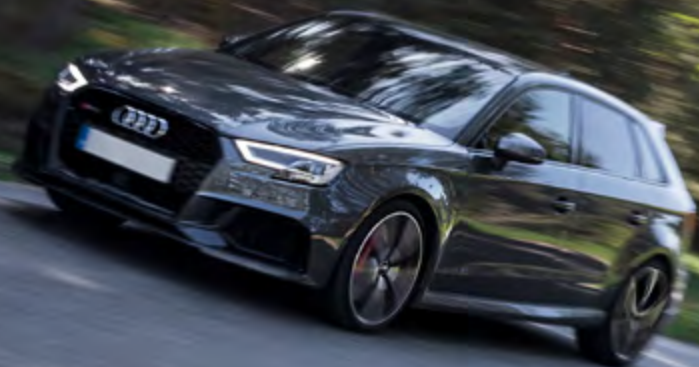
ROAD & TRACK