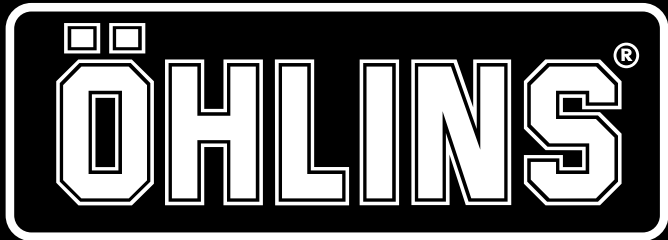
ÖHLINS BLACK/WHITE MEDIUM