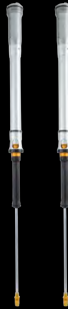
TTX 22 CARTRIDGE KIT