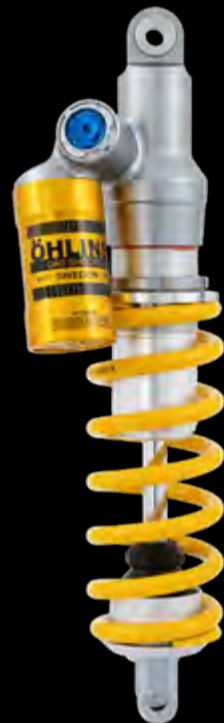
TTX FLOW WITH PDS SHOCK ABSORBER