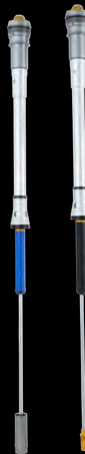
STX 22 CARTRIDGE KIT