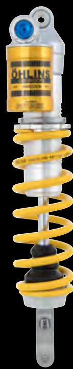
TTX FLOW SHOCK ABSORBER