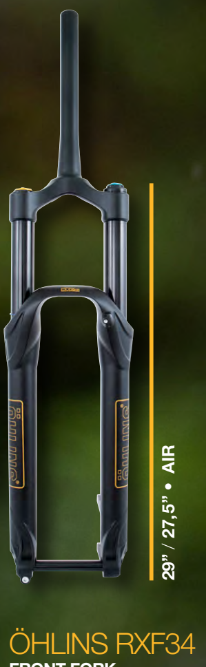
ÖHLINS RXF34 FRONT FORK