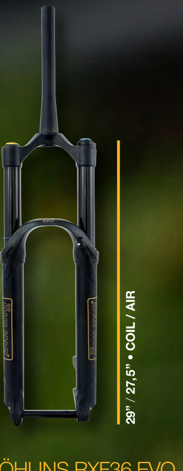
ÖHLINS RXF36 EVO FRONT FORK